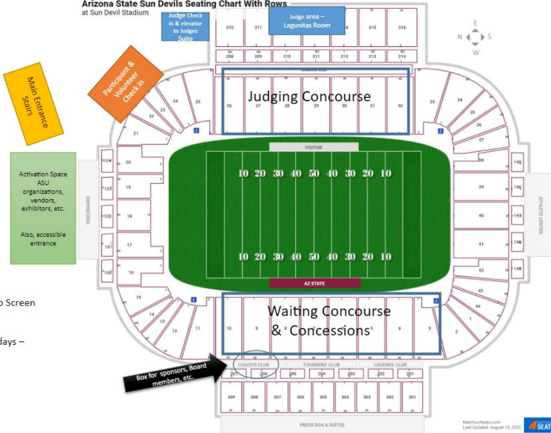
Arizona State Sun Devils Seating Chart With Rows at Sun Devil Stadium

All TV's and Jumbo Screen will play live and recorded feed throughout both days -